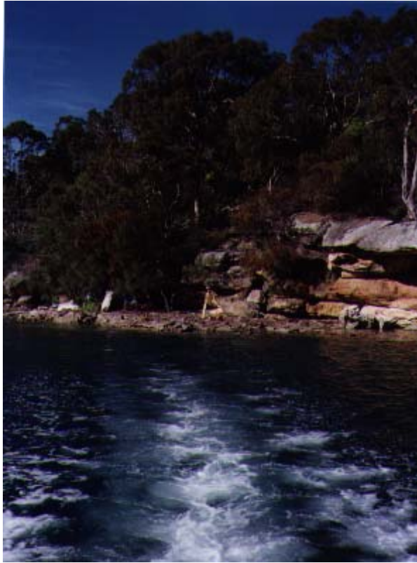
Figure 2. SSM 57110, point 3