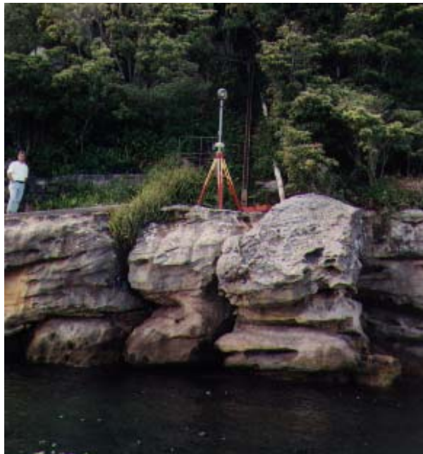
Figure 3. SSM 57112, point 4