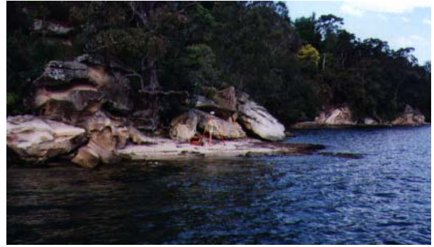
Figure 4. SSM 68977, point 5